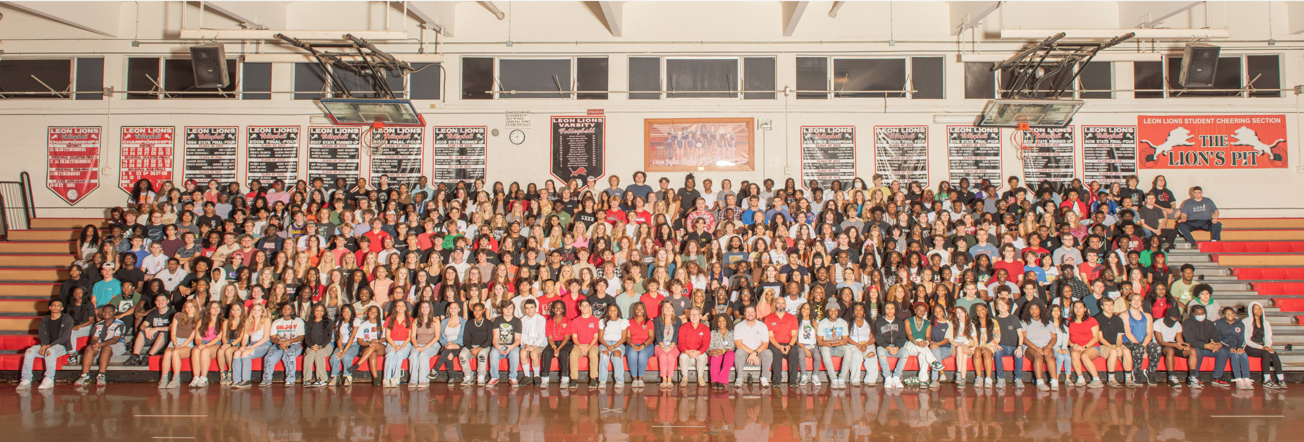
Leon High School Senior Class 2024

Visit gradimages.com/classphotos and search by school name to order your photo. Or call 800-261-2576